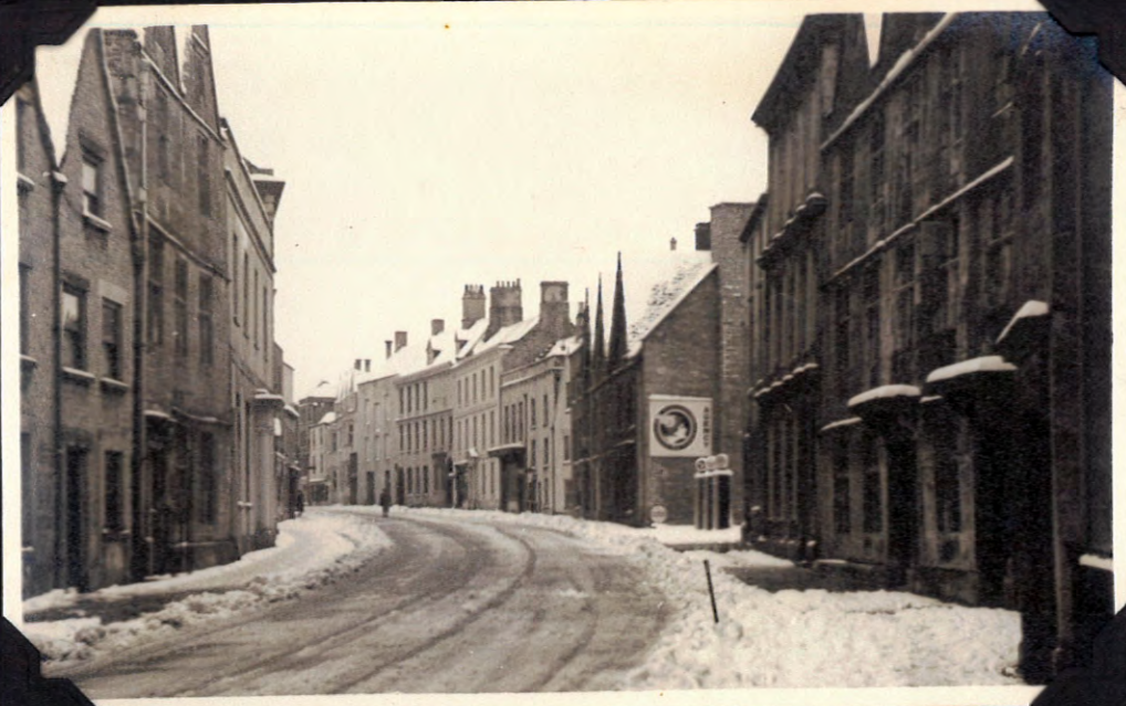
Long Street (from our front door)