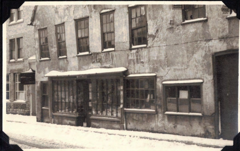
Old Shop (Witchell's)